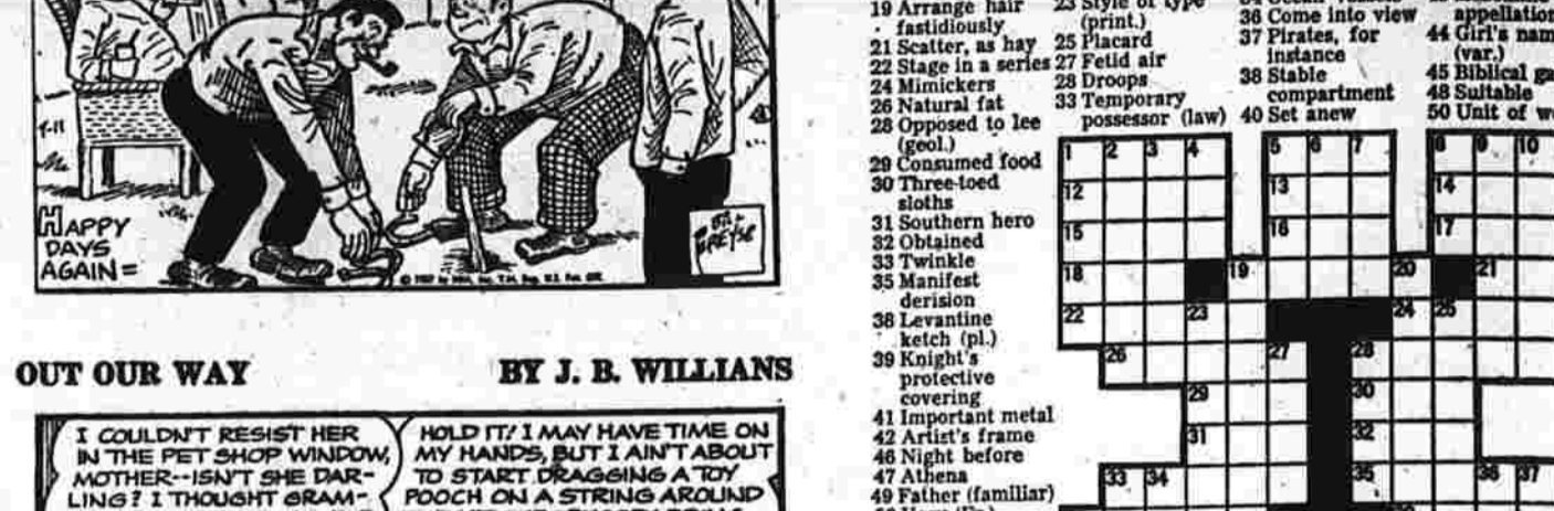
OUT OUR WAY